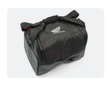
INNER BAG FOR 38L TOP BOX